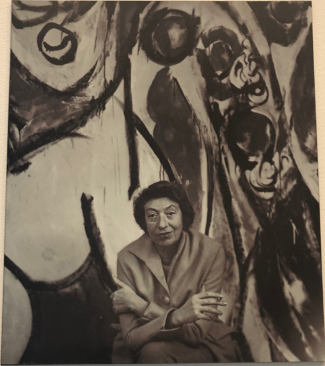
Lee Krasner in front of her painting The Seasons, 1957